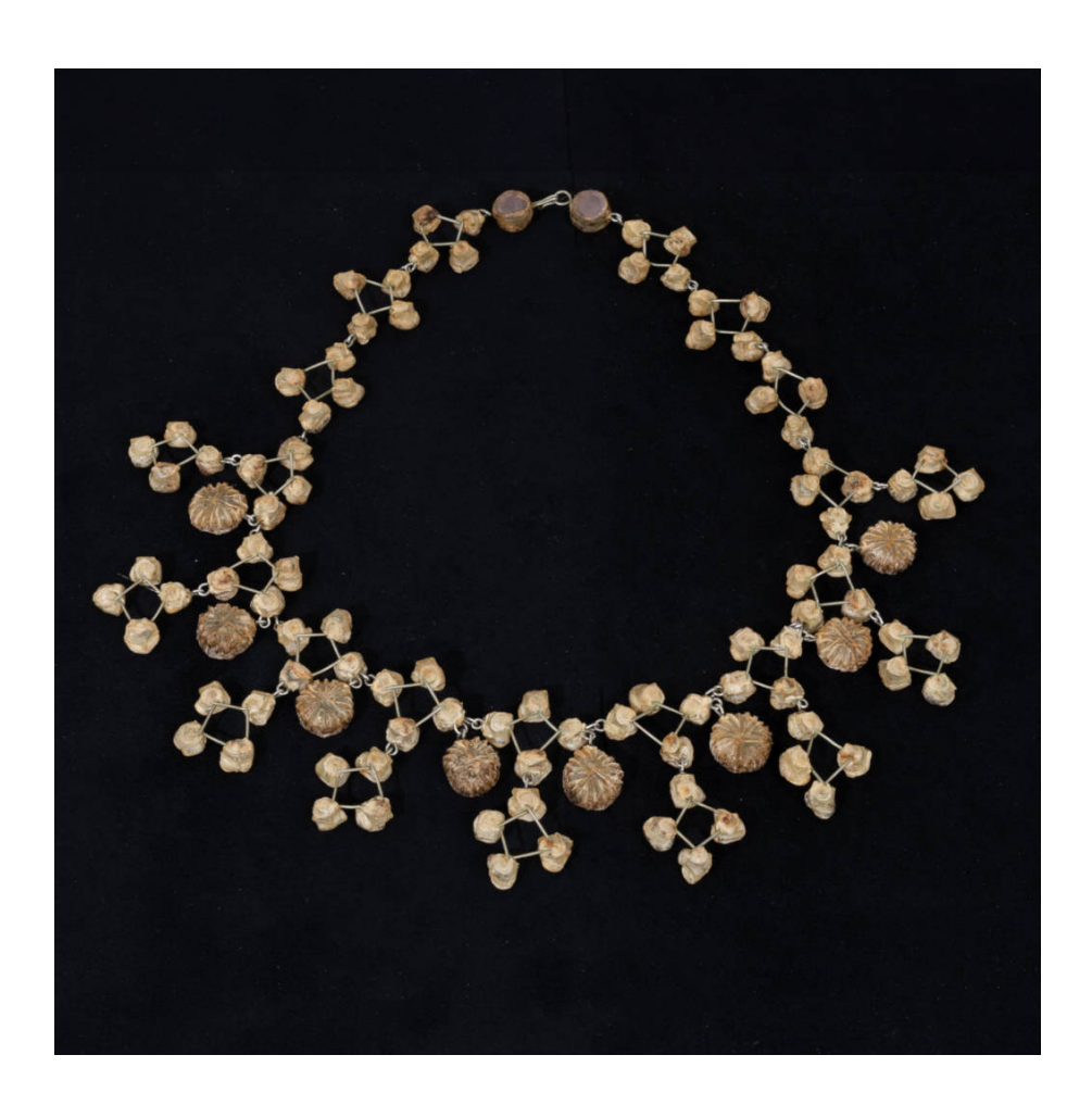
Similar model Permanent collection Musée des Arts Décoratifs - Paris Jewelry section