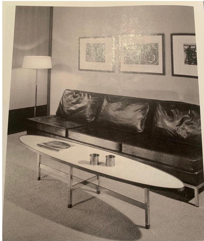
Trois types de tables basses avec pieds en acier inoxydable, table ovale en formica blanc 870, page précédente et ci-dessous, table ronde 868, page suivante, table basse ronde 869