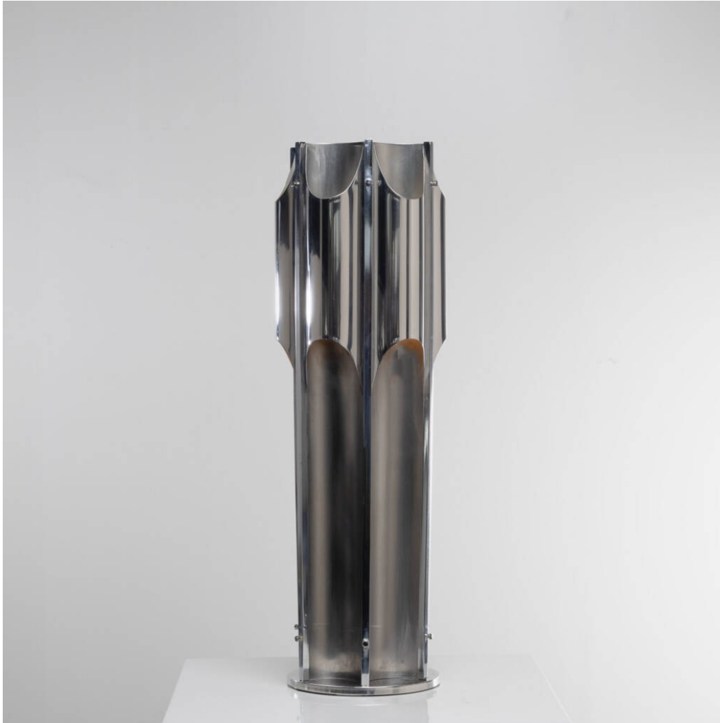
Table lamp by Jacques Charles